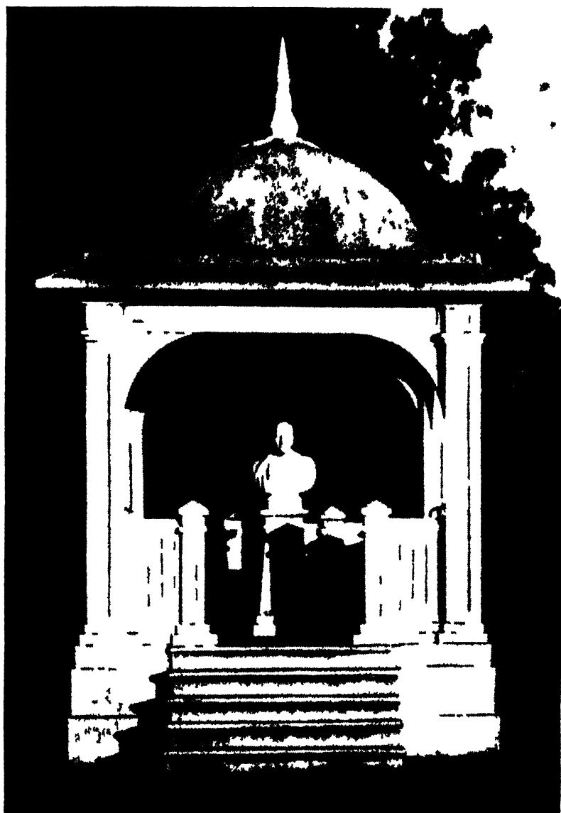
Marble Bust at Jamshedpur